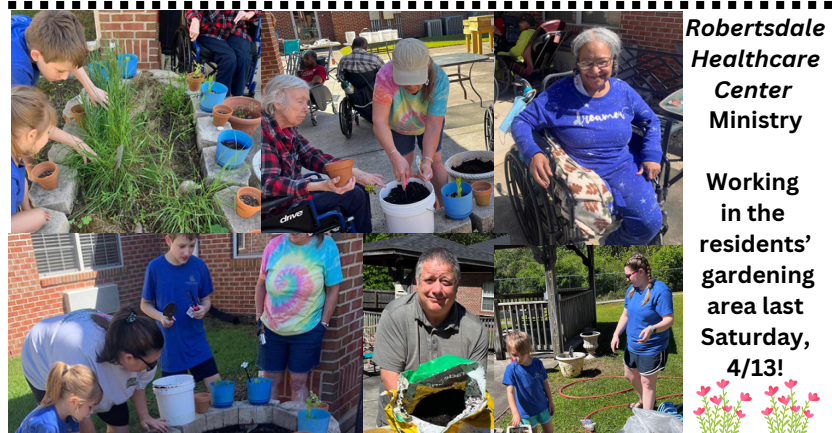
Robertsdale Healthcare Center Ministry

Working in the residents' gardening area last Saturday, 4/13!