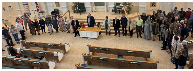
What a blessed Lord's Day last week!

WELCOME TO OUR NEW BROTHERS & SISTERS IN CHRIST